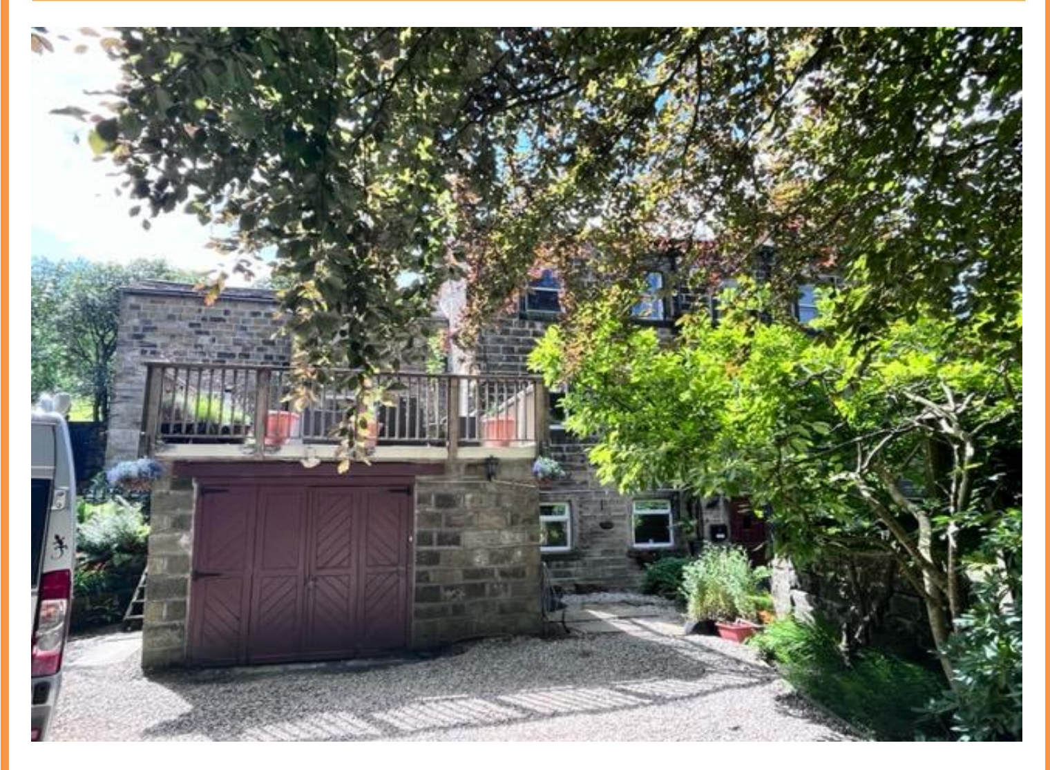
Lock House, Haugh Road, Todmorden, OL14 6BT